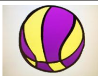
The logo : a basket ball in purple and yellow