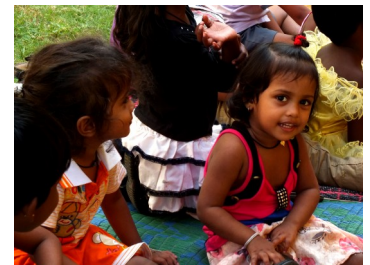
Kids at Dutch Anne Pre-School

unteers took out all the writing tables and small chairs and respectively painted it with blue and pink colors. It was a hot day out in the middle of the compound and volunteers seemed to enjoy the hot sun! After finishing the painting, they started to paint the inside