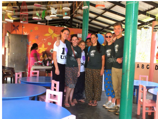
Volunteers after the "dirty day"

We had our small dirty day at the Dutch Anne Pre-school on 24 th January. Our aim was to paint the desks, chairs and the inside walls. The pre-school started the new term for 2014 and they have newly enrolled children, so a color wash was needed to look more appealing to the new children. Most of the teaching and care volunteers were involved in this, as well as the medical interns also gave a hand. Firstly, all the vol-