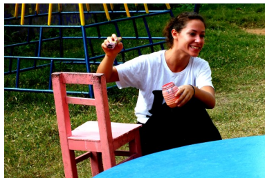
A Volunteer paints under the hot sun

walls too. They were patient enough to save the alphabet which was already on the wall. Thank you to the medical interns for helping out the other volunteers. It was a great help to the pre-school. Well done all!