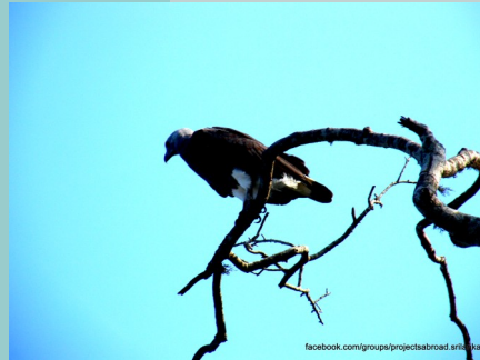
Udawalawa national park.